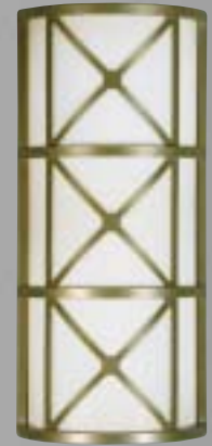
GRILL Decorative Aluminum Grill