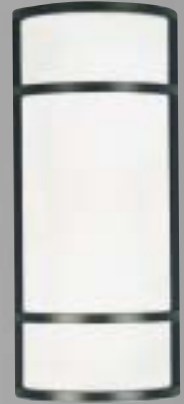
DC Double Cross Bars