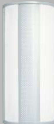
MPERF Middle Perf