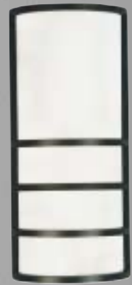
3CB Three Cross Bars