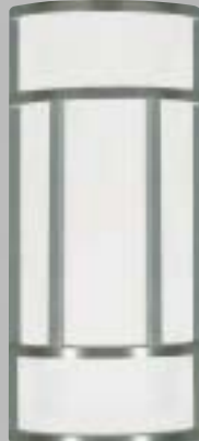
DC/2VB Double Cross Bars with Two Vertical Bars