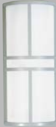
VB Vertical Bar