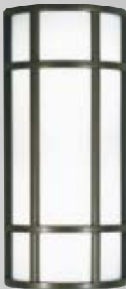
WEB Double Cross Bars with Two Full Vertical Bars