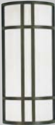
DC/2MB Double Cross Bars with Two Middle Bars