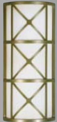
GRILL Decorative Aluminum Grill