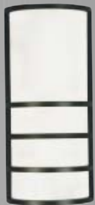
3CB Three Cross Bars