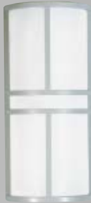
VB Vertical Bar