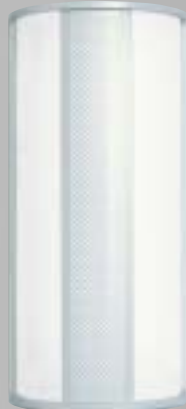
MPERF Middle Perf