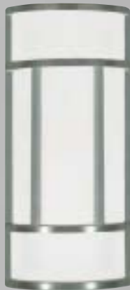
DC/2VB Double Cross Bars with Two Vertical Bars