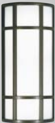
WEB Double Cross Bars with Two Full Vertical Bars